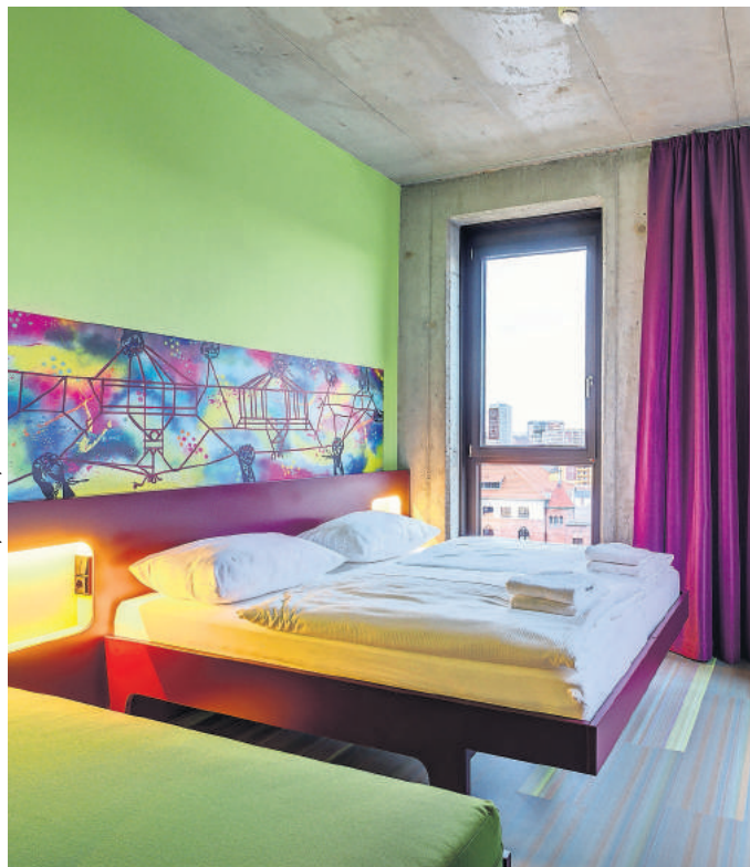
COVER IMAGE: 1898 THE POST HOTEL, GHENT, BY ALEX STEPHEN TEUSCHER

As the name suggests, this new boutique hotel celebrates avant-garde artists and pioneers in the fields of music, literature, design, fashion and architecture. Each room takes its inspiration from a different visionary: the Frida Kahlo room has vibrant hues and tropical prints; Andy Warhol has a splash of pop art colour. It may sound gimmicky, but it's all done with flair and good taste, and the views from the pool terrace over rooftops and the Douro river are some of the best in the city. The in-house Digby restaurant offers contemporary dishes with the flavours of Portuguese gastronomy. ● torelavantgarde.com